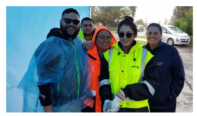
The HNZ and SHL teams at the street clean-up

The day dawned with a forecast of severe thunderstorms and heavy rain. However, this did not faze the teams, who turned up