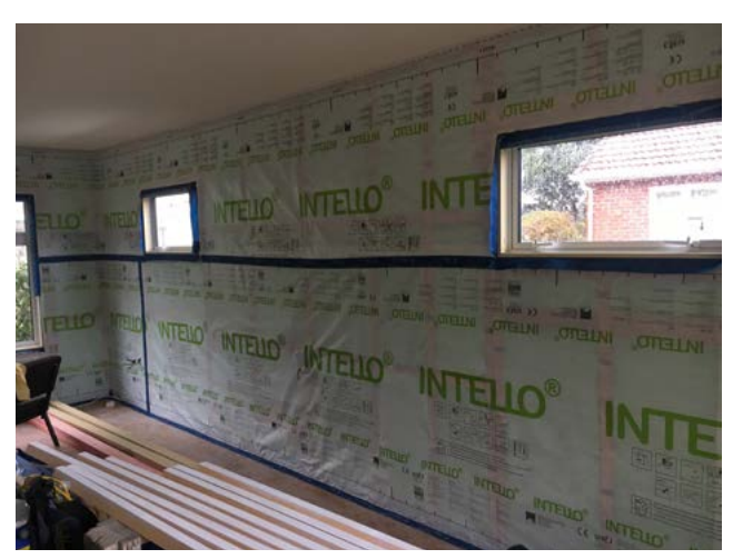
One of the Hutt homes in the thermal upgrade pilot

Switched On says quick thinking from the Clean Up Canterbury team of Paul, James and Nicole certainly saved a beloved tenant's pet from harm. In the process, they also saved the house from significant or possibly total damage.