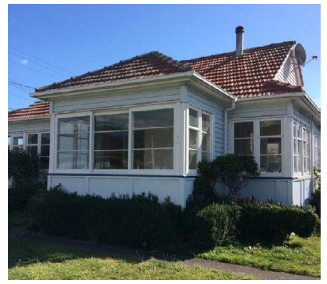
One of the Hutt homes in the thermal upgrade pilot