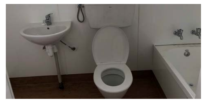
A brand new bathroom for the tenant

While these situations present a real challenge, the end result is always worth it. Thanks, PFM, for all your hard work on this one.