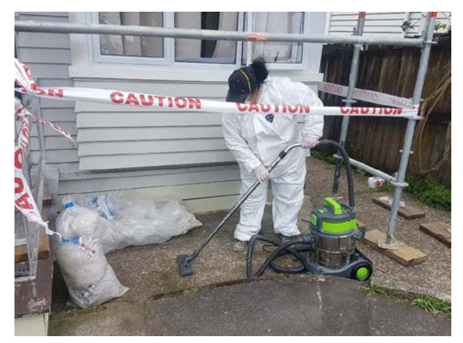
SHL's new Vacmaster machine in action

"As the health and safety of our staff and tenants is our top priority, we decided to make the machines available to all supervisors and at no cost to our interior and exterior carpenters and painters and exterior pre-paint maintenance contractors across all four SHL regions," Tom says.